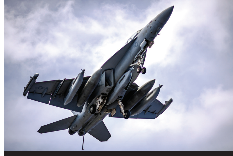
A U.S. Navy EA-18G Growler operating from a Nimitz-class aircraft carrier.

He added that Northrop Grumman understands the Navy's future Electromagnetic Maneuver Warfare (EMW) mission environment will require a software defined, hardware enabled design approach that allows for a rapid changing of systems capabilities pushed out to the fleet quickly.