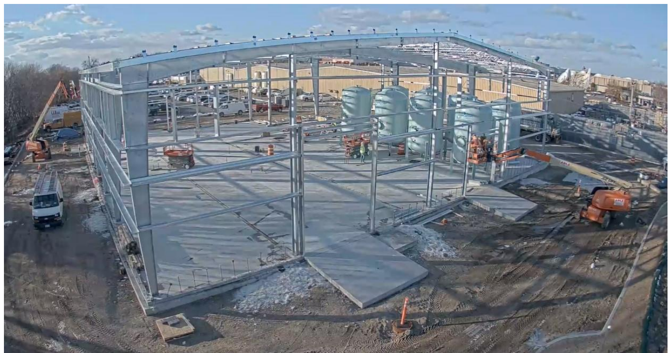
Treatment System Construction Progress: We are making very good progress on the construction of the RW-21 treatment system building. The exterior steel structure is nearly installed as are eight carbon filtration tanks. (Aerial image taken Jan 10).

Updates to Bethpage School District Walkers/Bus Routes: No additional updates.